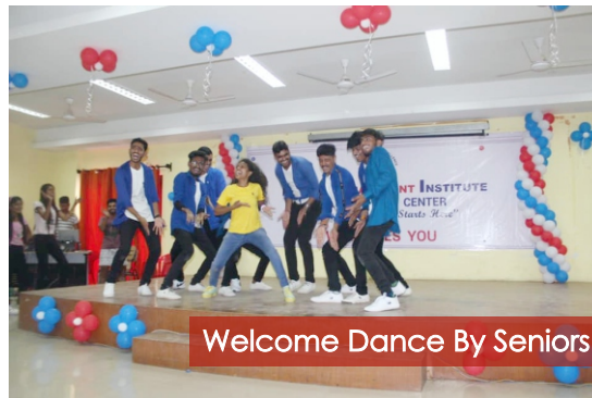
Welcome Dance By Seniors