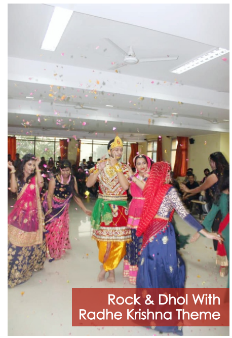
Rock & Dhol With Radhe Krishna Theme